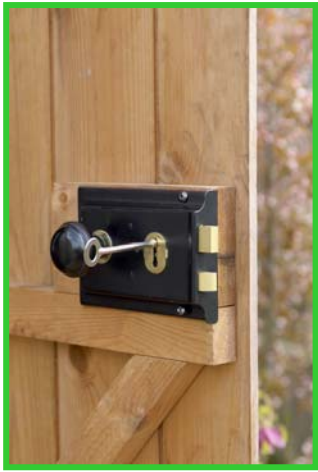
Sterling's rim sashlock

For added security, consider fitting a rim sashlock to the door. With a reversible latch and a key operated deadbolt, this sort of security is way to show burglars you mean business. Don't forget to make sure that shed windows are shut as well!