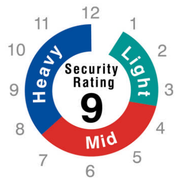
Sterling Security Rating